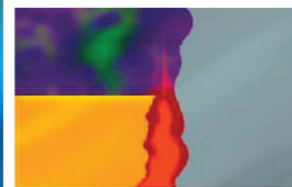
Sealant bridging across leak site.