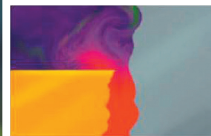
Fluid escaping through leak site.

Seal-Tite® International has a line of unique pressure-activated sealants that seal leaks in oilfield environments.