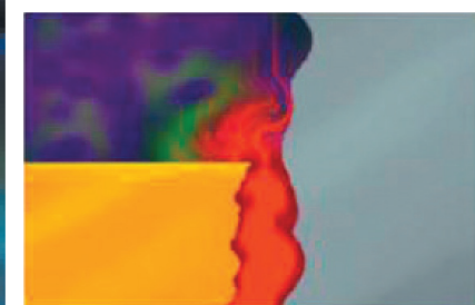
Sealant building in leak site.